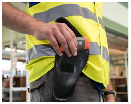
Holster included (DIT-130 only)